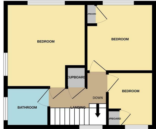
1ST FLOOR 372 sq.ft. (34.5 sq.m.) approx.